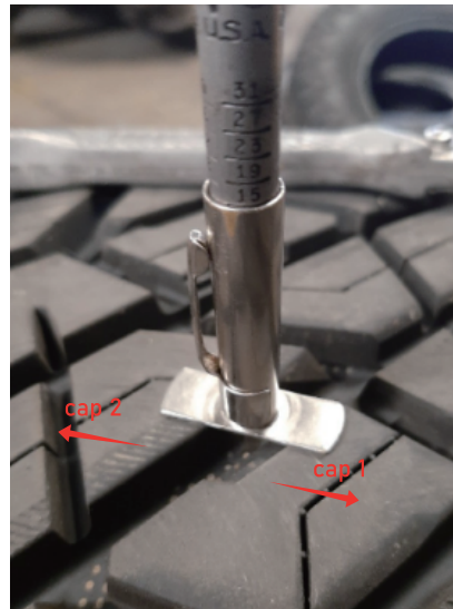
2. Tread depth