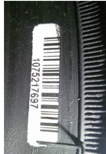
3. Serial number/ bar code